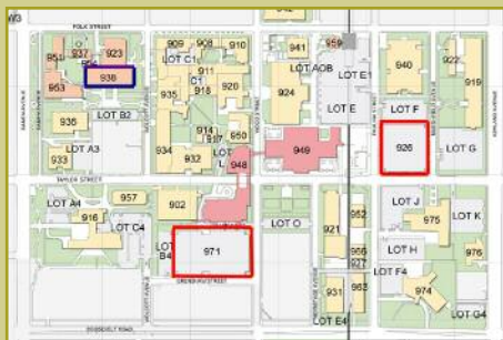
Student Center West outlined in Blue Parking Structures outlined in Red

Take the Dan Ryan Expressway (I-90/94) and exit on Roosevelt Road (1200 south); go west on Roosevelt Road to Wood Street; then go north on Wood Street to the campus.